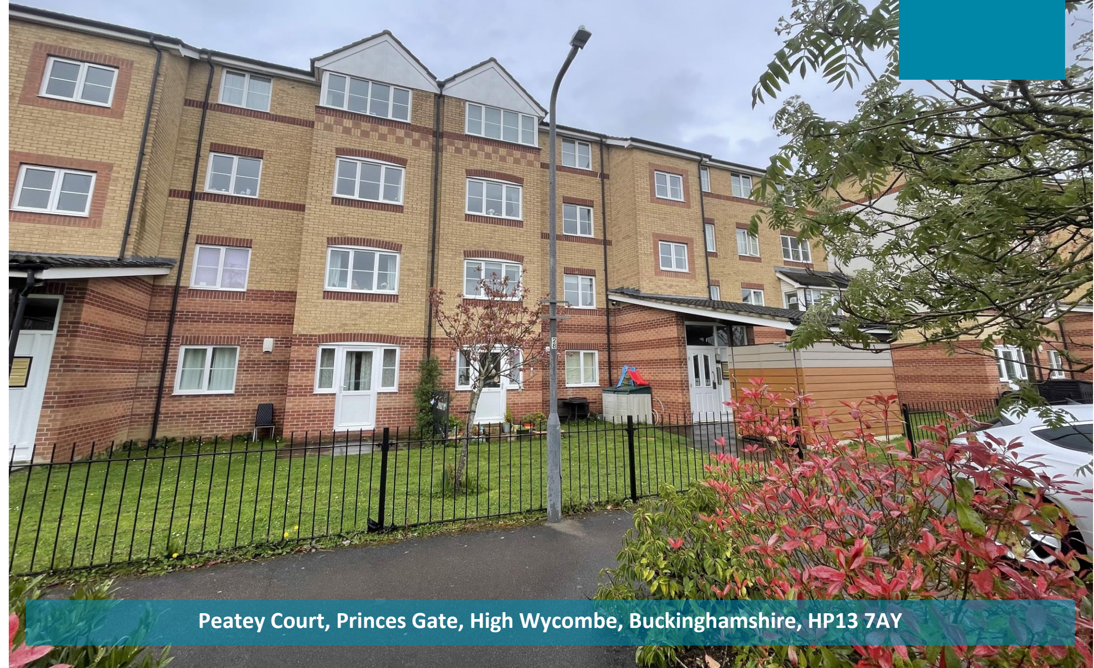
Peatey Court, Princes Gate, High Wycombe, Buckinghamshire, HP13 7AY